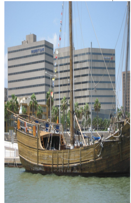
Above: sail boat in harbor across from hotel.