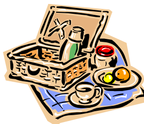
Let's have a picnic!

Condolence may be sent to: Kenneth Weerheim, PO Box 14, Armour SD 57313