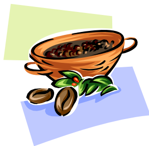
Stirring up conform food on a bold day.

We were given: Two hands to hold. Two legs to walk. Two eyes to see. Two ears to listen. But only one heart? Because the other was given to some one else for us to find." Unknown