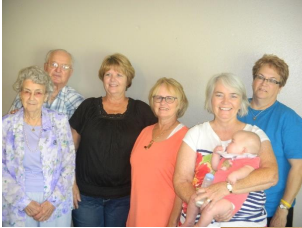
September 15 RASCOE Lunch at Fort Randall County Club, Pickstown