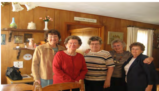
Past employees of Sanborn County